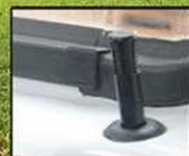
Front Power Lock