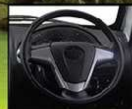
Electronic Power Steering

Now upgraded with Electronic Power Steering, Power windows and so much more!