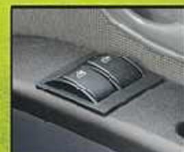
Front Power Windows