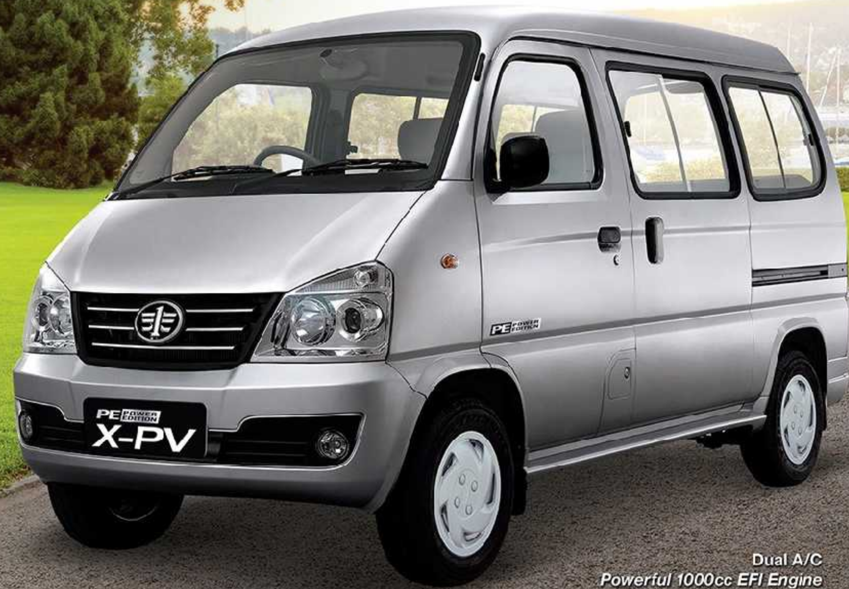
Dual A/C Powerful 1000cc EFI Engine