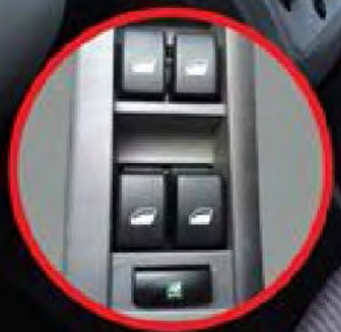
Electric Power Windows