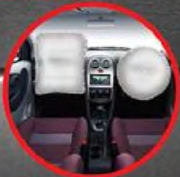
Dual Air Bags