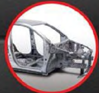
High Rigidity Body Cage