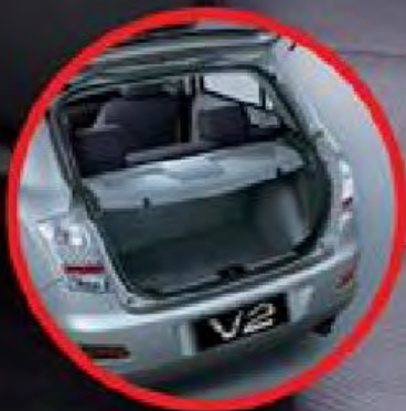
Large Trunk Space

Whiz by the others in the whizzing V2, the car that has it all. Topped off with an elegant exterior, it gives you the delicate touch of a sports car. With its precise and advanced technology, you can cruise the roads in style. Its strengthened body structure and assorted safety equipment give you the security you want. An ultra energy efficient VCT-i engine gives you the optimal performance you desire in terms of power, torque and mileage. Built with power-oriented comfort, this car has a BIG Heart!!! It gives all the best things that you demand against your money. A car best suited to Pakistan in terms of power, safety, space, mileage and above all, value for your money.