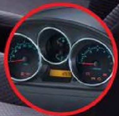
Barrel Type Inst. Panel