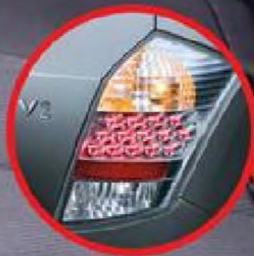
LED Tail Light