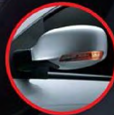
Outside Mirrors with Turn Signals