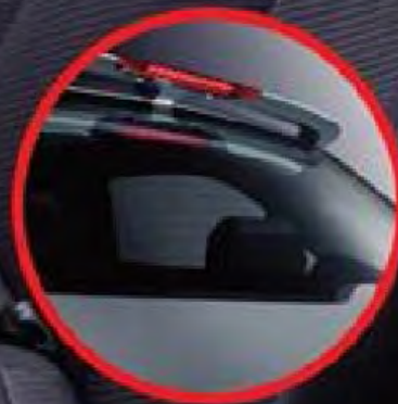
High Mounted Brake Light