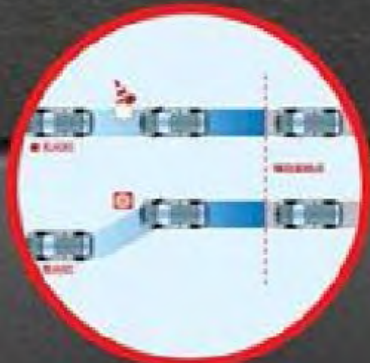
Bosch ABS + EBD Brakes