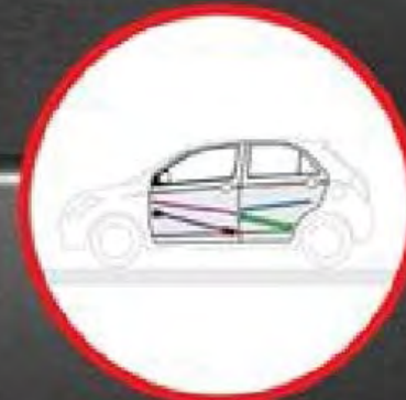
Built-in Door Crash Beam