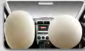
Dual Air Bag