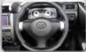
Leatherite Power Steering