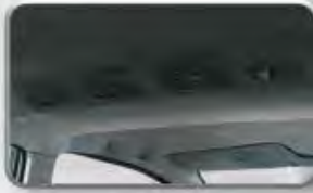
Dual A/C *