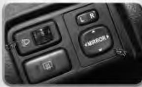
Power Side View Mirrors