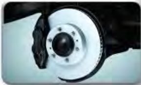
ABS Brake with EBD