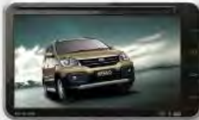
DVD Player with Rearview Camera*