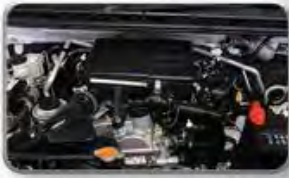
Powerful Economical 1.3 & 1.5 Litre VCT Euro 4 Engine