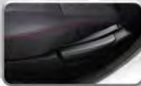
Fully Adjustable Front Seats