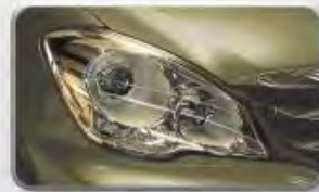
Adjustable Projector Type Headlights with Integrated LED Turn Signal