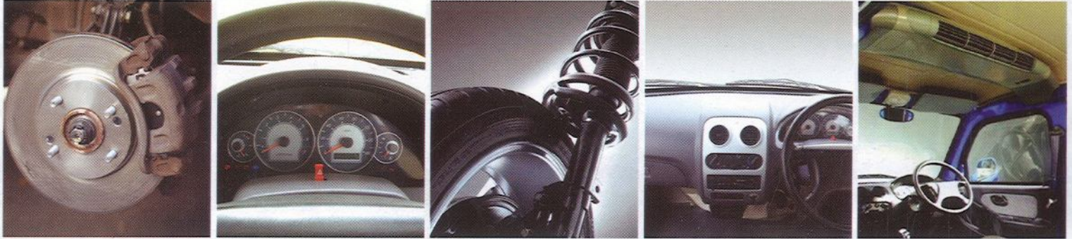
Front Disk Brakes

A 1000cc (60hp) Petrol EFI Engine with Euro 4 Emission Standard. More fuel efficient, more environment-friendly.